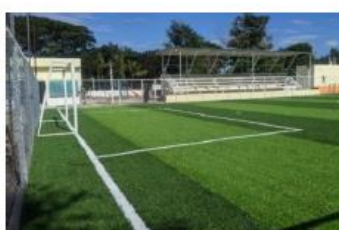
Cancha de Fútbol 7 Municipio de San Francisco del Mar