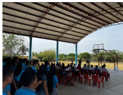
Taller de Diseño Participativo, en el municipio de Acapetahua, Chiapas