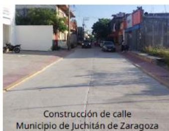
Construcción de calle Municipio de Juchitán de Zaragoza