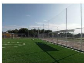
Unidad Deportiva Municipio de Unión Hidalgo