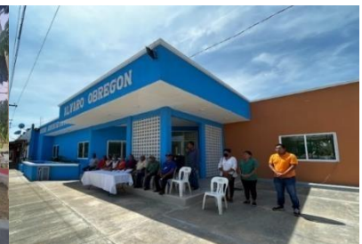
Municipal Admin Offices renovation Municipality of Tapachula

In addition, there was an intervention for the rehabilitation of 18 schools on the K and FA lines, in the states of Chiapas, Tabasco and Veracruz, Tables 3, 4 and 5 show the progress corresponding to each state until the end of 2024.