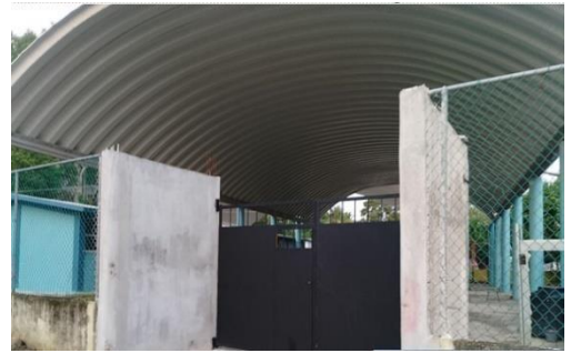
"Josefa Ortiz de Domínguez" Secondary school renovation