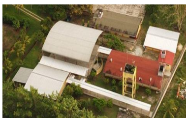
Secondary school renovation "Carlos Pellicer Cámara" Municipality of Huehuetán

Photo evidence: attention to schools in the state of Chiapas.