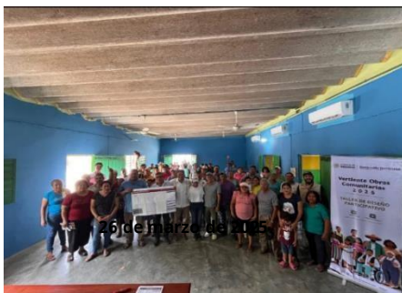
Taller de Diseño Participativo, en el municipio de Pijijiapan, Chiapas