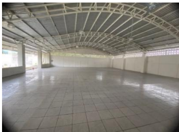
Space to share Municipio de Acacoyagua