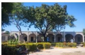
Casa del Pueblo Municipio de San Francisco Ixhuatán