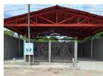
Galera Comunal Municipio de Reforma de Pineda