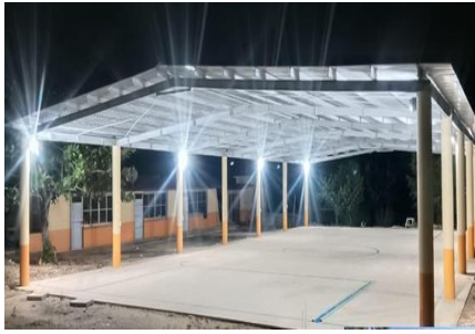
Comprehensive intervention for the "Francisco I Madero" Tele-secondary