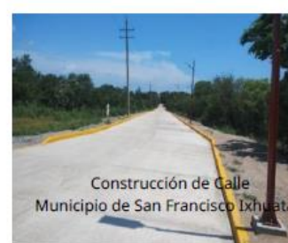
Construcción de Calle Municipio de San Francisco Ixhuatán