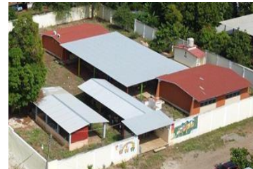
"Gustavo Adolfo Bécquer" Preschool renovation