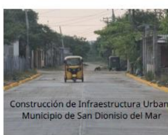
Construcción de Infraestructura Urbana Municipio de San Dionisio del Mar