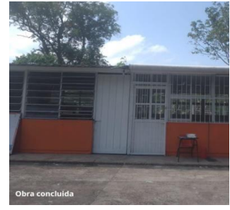
Comprehensive intervention for School renovation "Alejandro Luque Domínguez"