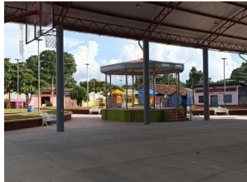
Renovation Municipal Auditorium Park and space to share renovation Municipality of de Huixtla Park and space to share renovation Municipality of Villa Comaltitlán Municipio de Acapetahua