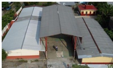
Primary School renovation "Emilio Carranza" Municipality of Huehuetán