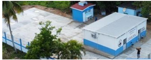
Comprehensive intervention for the construction of "Lic. Benito Juárez" Primary school

Continuing with the PMU, IN March 2025, 53 Works Committees were formed and 53 Participatory Design Workshops were executed in the states of Chiapas, Oaxaca and Veracruz, in order to define works to be executed. For this exercise, the implementation of 163 assemblies stands out, with attendance of 2,624 neighbors.