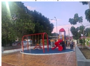
Miguel Hidalgo park renovation Municipality of Huehuetán