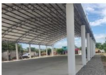
Domo Municipio de Juchitán de Zaragoza