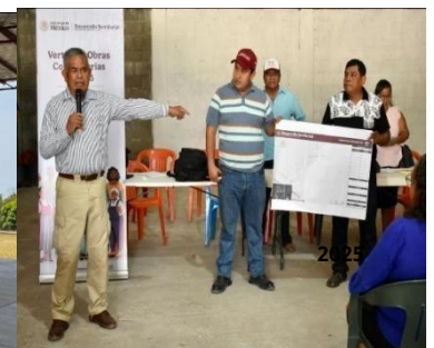
27 de marzo de Taller de Diseño Participativo, en el municipio de Estación Sarabia, Oaxaca