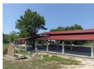
Salón de Usos Múltiples Municipio de San Pedro Tapanatepec