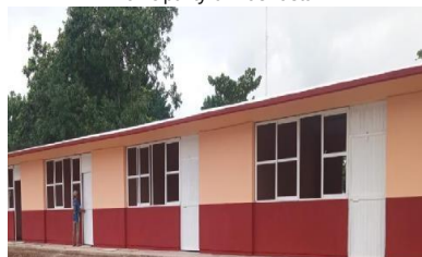
Municipality of Huehuetán